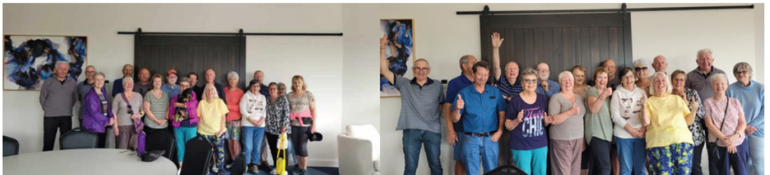
Lincoln Walkers before....

A big thank you to [REDACTED] for helping with our first directory.