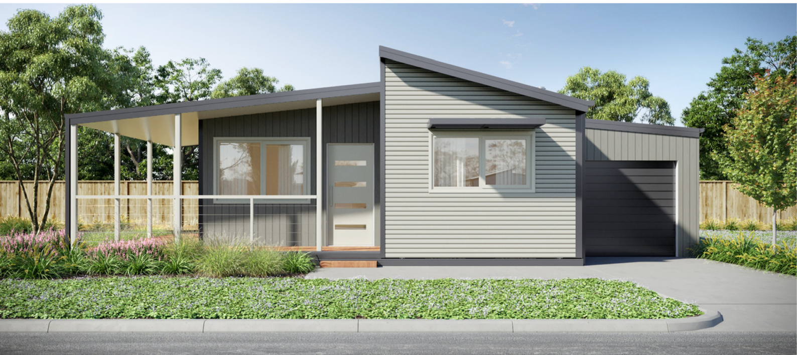
External Colourway B

The Jasper offers a spacious solution to downsizing without compromise. This beautiful home includes a statement wrap-around verandah, separate laundry and two well configured bedrooms, complete with built-in wardrobes. The thoughtfully designed layout includes a bathroom with large shower, a separate toilet and a spacious open-plan living, dining and kitchen area. There is also a carport for one car.