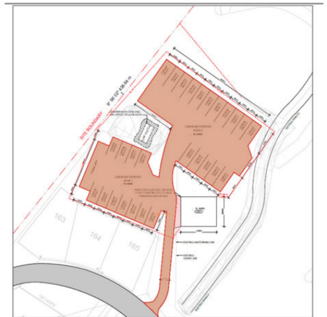
Caravan /Trailer & Boat Parking Plan

The Space is designed for multiple purposes in mind to enable residents to use the space as they wish.